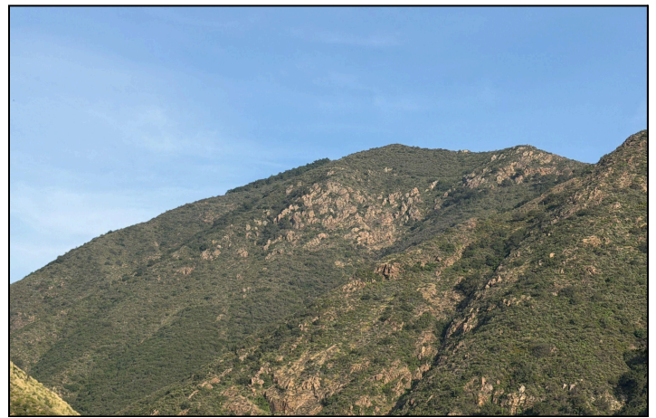
A view looking north of the Cleveland National Forest's Trabuco District and its densely covered chaparral habitat.

"The Roadless Rule keeps big, unbroken forestlands intact, providing high-quality habitat and migration corridors for hundreds of vulnerable wildlife and plant species," says Steve Messer, from the California Mountain Biking Coalition . "It sustains outdoor recreation and local economies—hunting, fishing, hiking, biking, and tourism—by keeping backcountry landscapes wild and quiet."